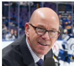
Darren Pang TNT/Chicago Black Hawks analyst