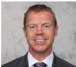
Kris Draper Former Red Wing great and four-time Stanley Cup champion