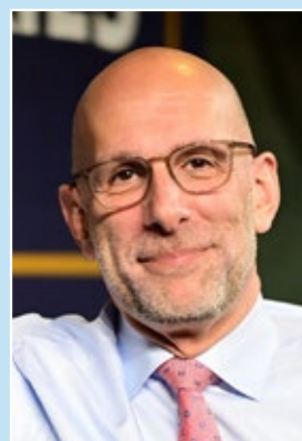
DAN SHULMAN Toronto Blue Jays play-by-play announcer