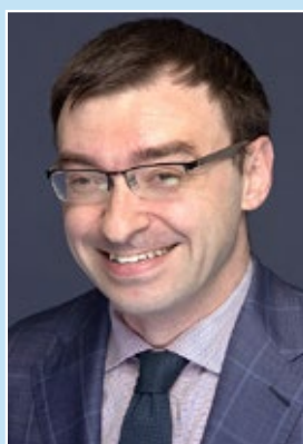
JASON BENETTI Detroit Tigers TV play-by-play and FOX Sports basketball & football play-by-play