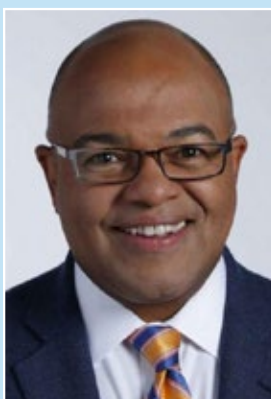
HOST MIKE TIRICO