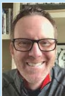
LEN KASPER Chicago White Sox Radio play-by-play