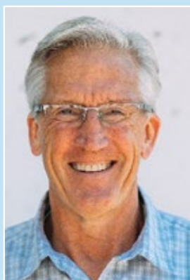
DAN DICKERSON Detroit Tigers Radio play-by-play