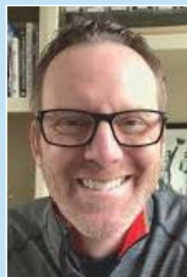
LEN KASPER Chicago White Sox Radio play-by-play