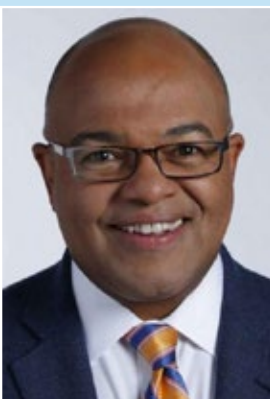
HOST MIKE TIRICO